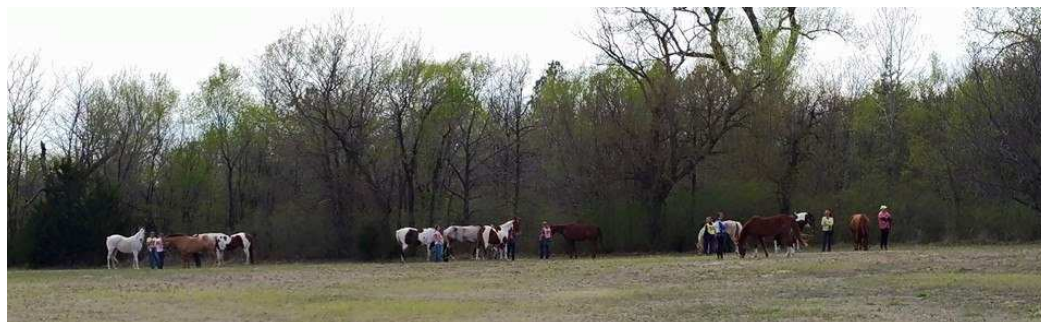
Vet check line up at Exploring Sand Hills CTR