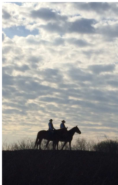
Safety riders Ty and Debbie McCullough silhouetted against the Exploring Sand Hills skyline